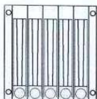
several pieces combined abreast